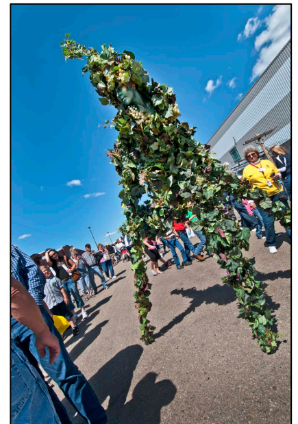
With ballet like movement the Living Vines were a huge crowd pleaser at the Nebraska State Fair.

Women outnumbered men 56% to 44% with 69% of those responding saying they were married or common law. The median age was 46.5 and the median household annual income was $56,058.